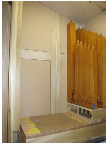
Inside swell box w/first pipes in place