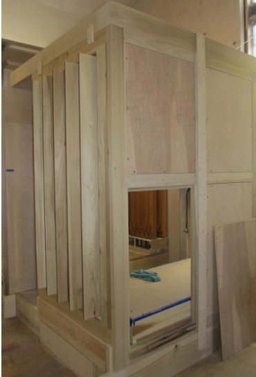
Swell box w/open side panel