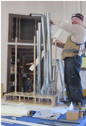
Shayne building 'racking' for bass pipes of Oboe rank