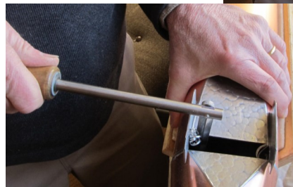
Close up of cut-up procedure

The last of three groups of new console controls is soon to be installed. Voicing of 400+ pipes is 95% complete. The swell box will be ready to install behind the existing organ case by the end of the month. David is always happy to answer any questions anyone may have.