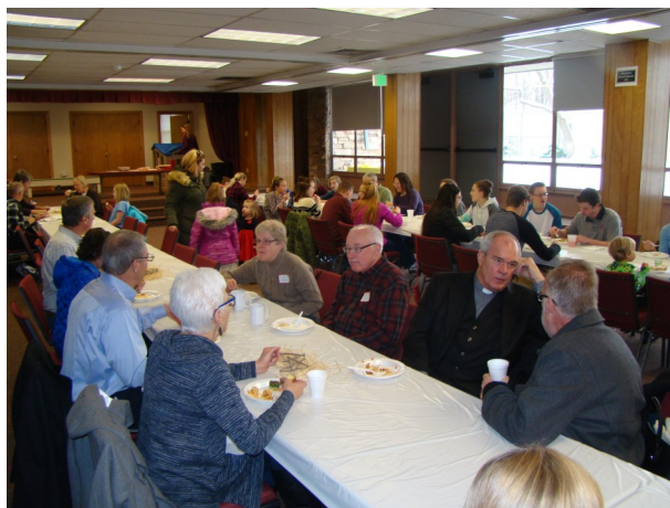
Epiphany Potluck, 2017