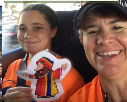
Flat Jesus Made it!